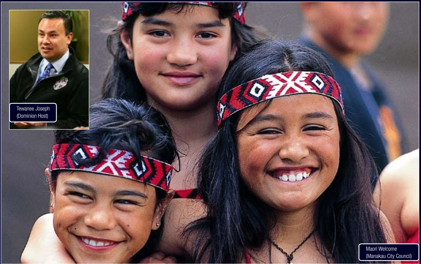
Maori Welcome (Manakau City Council)