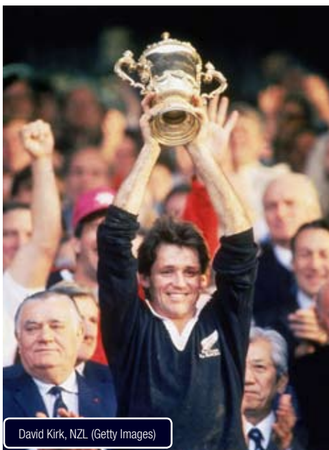
David Kirk, NZL

“RWC, and the money it generates, has enabled Andorra to develop as a Rugby nation. This wouldn't have happened without the World Cup as prior to its inception the IRB had no money.”