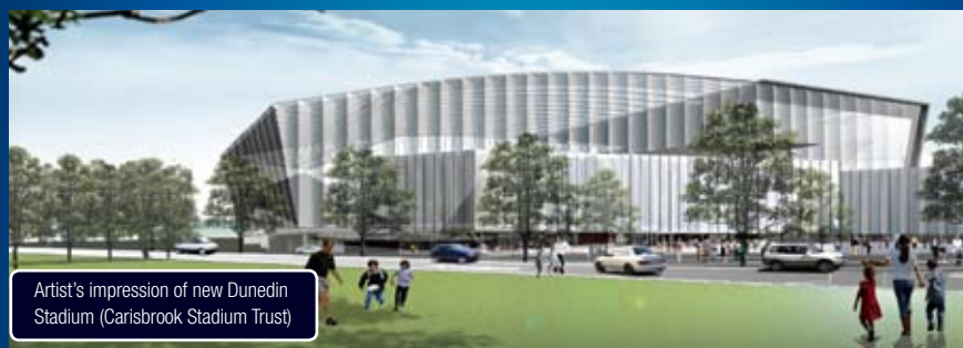
Artist's impression of new Dunedin Stadium (Carisbrook Stadium Trust)

The new hosts will work closely with RWCL and Rugby New Zealand (RNZ) 2011 on learning the key lessons of RWC 2011 and starting planning for their own Tournaments.