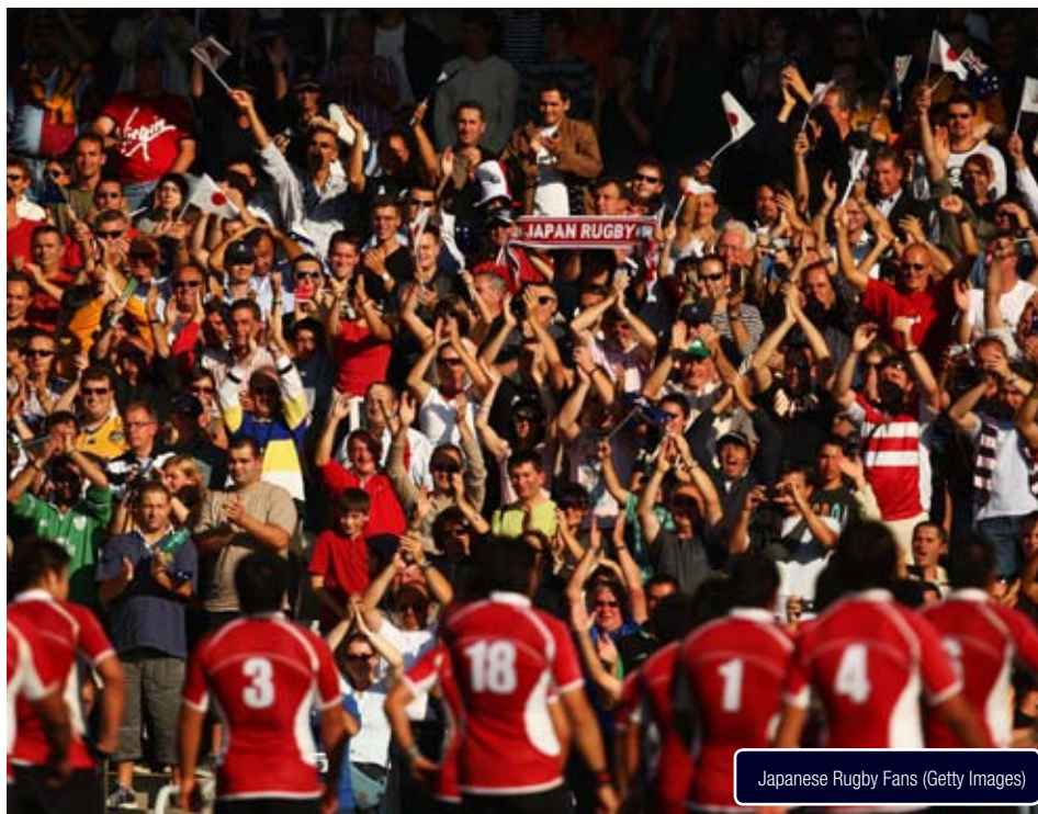
Japanese Rugby Fans