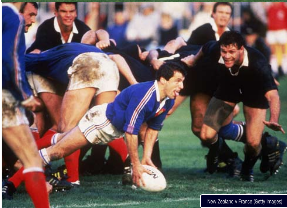
New Zealand v France