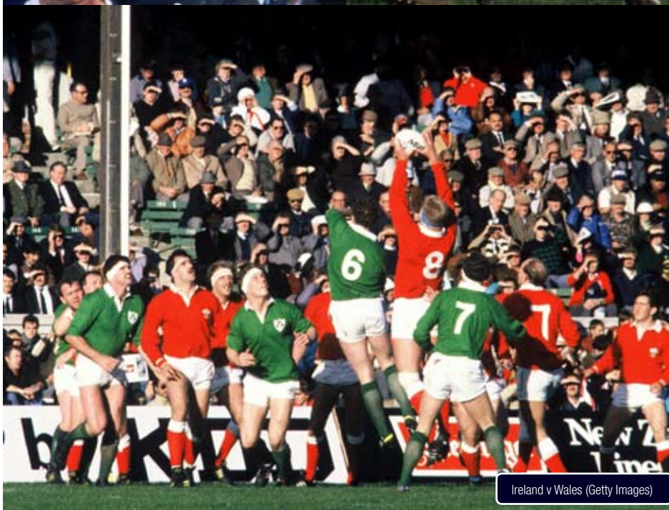
Ireland v Wales